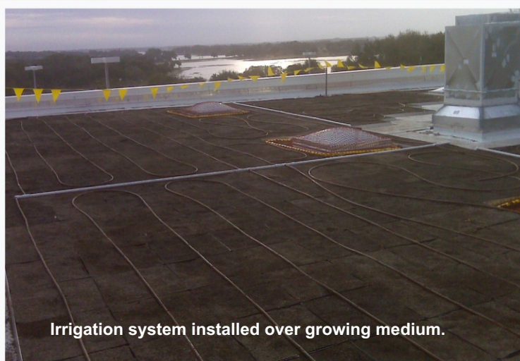
Irrigation system installed over growing medium.

Bringing Green Roofs to Life with Curlex