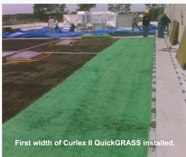
First width of Curlex II QuickGRASS installed.