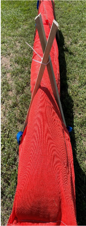
Criss-cross staking installation.

Durable, simple to transport, and easy to use.