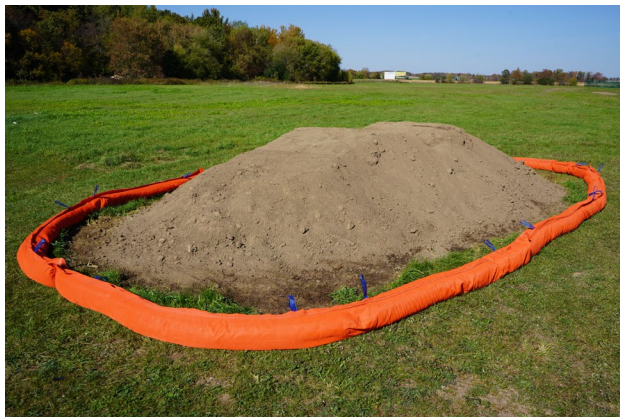
Stock pile protection.