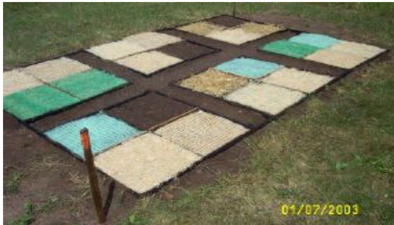
Figure 3. Vegetation study plots.

Additional activity in 2002 saw the construction of six 1 m x 1 m (3.3 ft x 3.3 ft) plots on flat ground to evaluate nitrogen levels below ECBs and TRMs. The plots were fertilized with 27-3-4 fertilizer. Products were installed over some of the plots and others were left uncovered. Soil samples were removed from the plots at predetermined time intervals and analyzed for nitrogen levels. This study was done to understand nitrogen movement in soil under an ECB or a TRM or without a surface cover on the soil. In 2003, the same six plots were further reduced to 0.48 m x 0.48 m (19 in x 19 in) and used as vegetation plots (See Figure 3). The vegetation study yielded vegetation density, total biomass production, and soil moisture enhancement ability for numerous erosion control products.