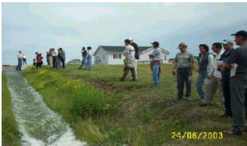
Figure 4. International Seminar on Watershed Management group observes a channel demonstration.

The International Seminar on Watershed Management, representing seventeen countries, visited the lab for a tour and educational meeting in 2003 (See Figure 4). These individuals were very interested in erosion control techniques that are used in the United States and shared the approaches to solving erosion control issues in their respective countries.