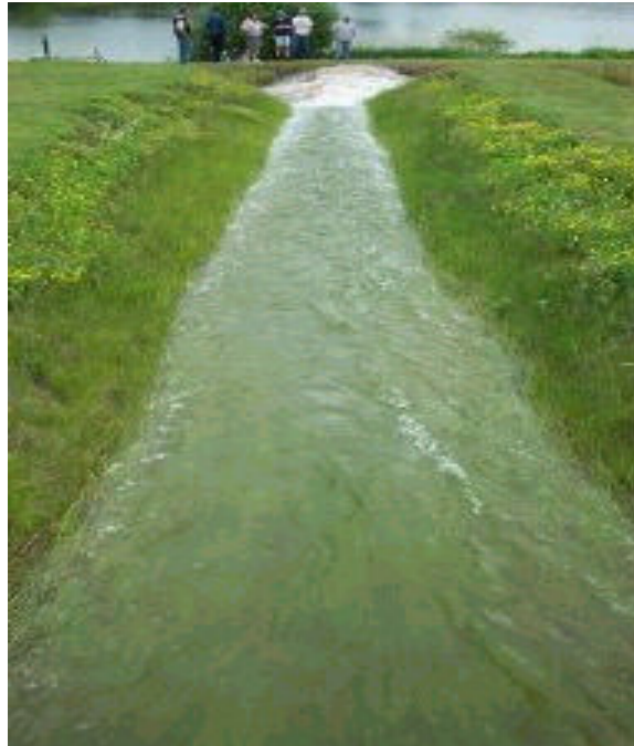
Figure 2. Vegetated Recyclax with approximately one foot of water in the channel.

It became evident that a larger data base of bare soil channel information was needed after analyzing the large amount of information that was created during the 2000 test season. Testing on bare soil channels began on CERF early in the 2001 testing season. Nine bare soil channels were prepared and tested. Certification of the company's new TRM was completed in mid-summer of 2001. In addition, five other channels were installed with the TRM, soil-filled, fertilized, and seeded. These channels were allowed to vegetate and testing began on these channels when vegetation ranging from 6 to 12 inches, equivalent to SCS vegetal resistance class "C", was present (See Figure 2). ASTM test standard D 6460 testing protocol was used as a guideline for testing the vegetated TRM channels. One vegetated TRM channel was subjected to 48 hours of flow.