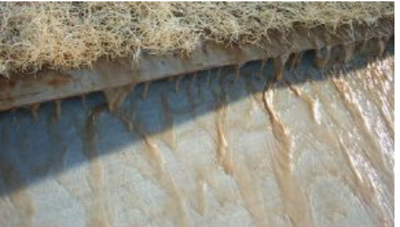
Figure 2. Runoff exiting plot during the 152 mm/hr (6 in/hr) rainfall test segment.

Once runoff commenced, grab samples were collected every three minutes to monitor runoff rates. All runoff from the plots was routed into the collection tank at the toe of the slope. Water was decanted and measured from the collection tanks after settling occurred. The soil slurry was transferred from the collection tanks into pre-weighed pails. The pails were then weighed to determine soil loss on a wet basis. A homogeneous sample of the soil slurry was taken to determine soil moisture content so the equivalent dry basis soil loss could be determined. The samples were analyzed following procedures outlined in ASTM D4643, "Determination of Water (Moisture) Content of Soil by the Microwave Oven Method" (ASTM, 2000). The six rain gauges were also recorded after each 20 minute increment to determine the average depth of rainfall applied to the test plot. Figure 2 shows runoff from a protected plot during the 152 mm/hr (6 in/hr) segment of the test series.