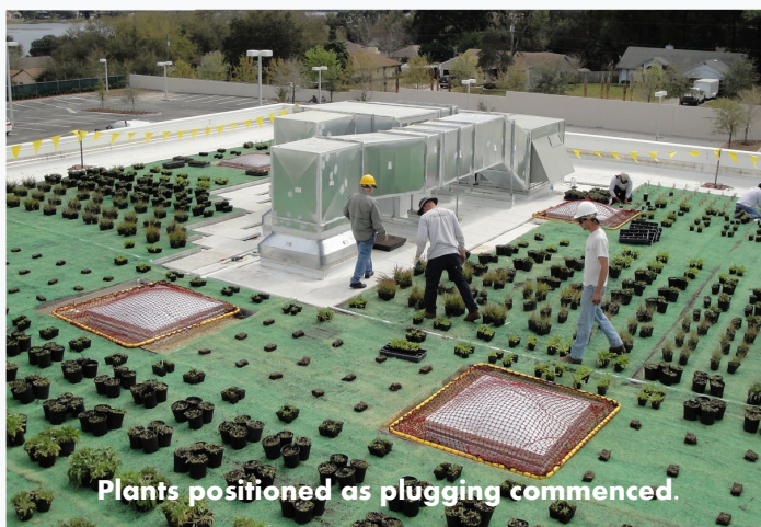
Plants positioned as plugging commenced.