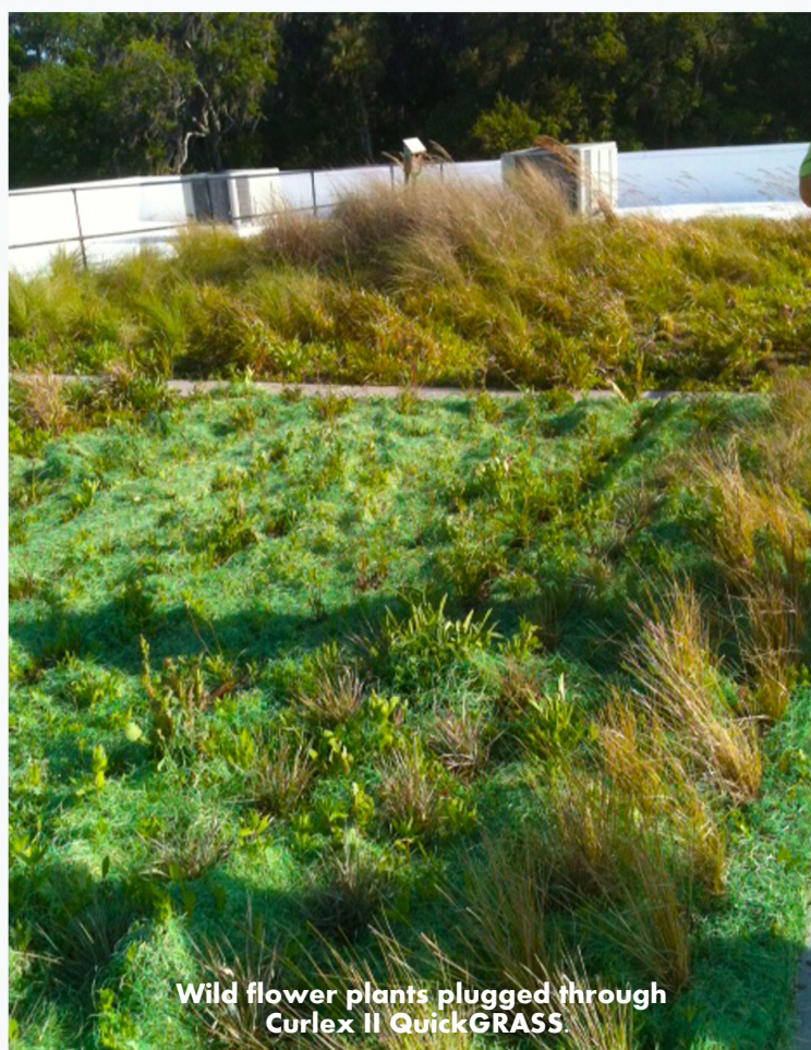
Wild flower plants plugged through Curlex II QuickGRASS.