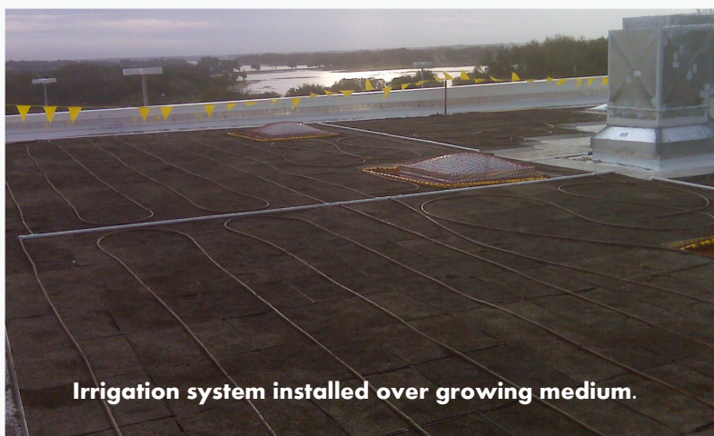
Irrigation system installed over growing medium.

Bringing Green Roofs to Life with Curlex®