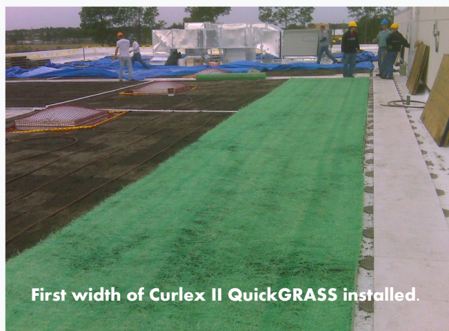
First width of Curlex II QuickGRASS installed.