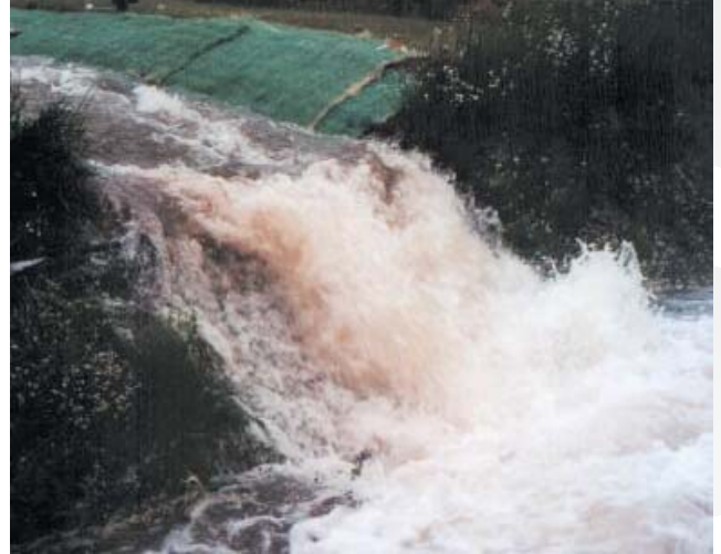
Figure 4. White water exiting test channel after flowing over green QuickGRASS®.

Be sure to specify Curlex QuickGRASS the next time you use a green ECB. The following suggested specifications can be followed to ensure you are buying a green product that is aesthetically pleasing, safe for the environment, and provides the high level of performance you expect from a Curlex ECB.