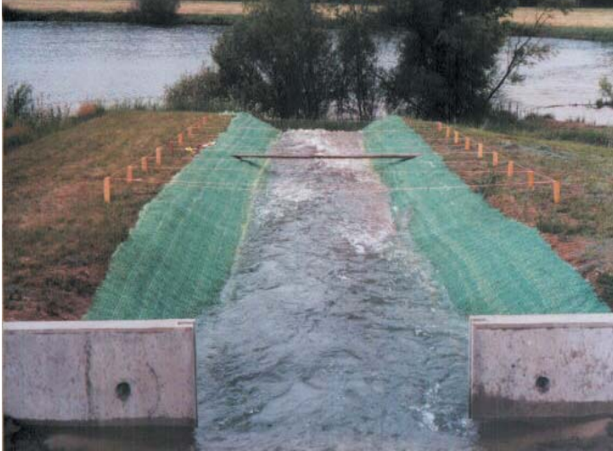
Figure 3. Hydraulic testing of QuickGRASS®.