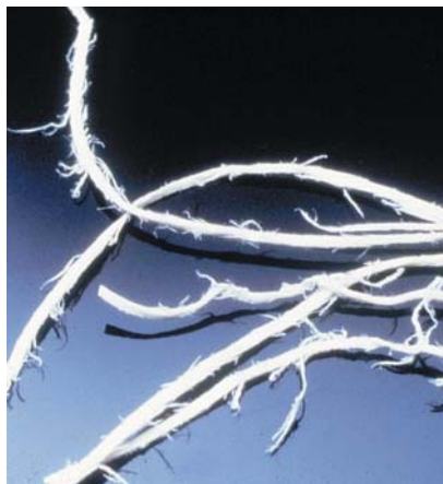
1. Quality Curlex Fibers