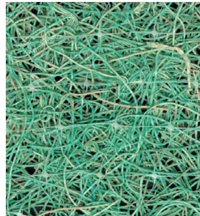
3. Quality Blanket with Curlex Fibers