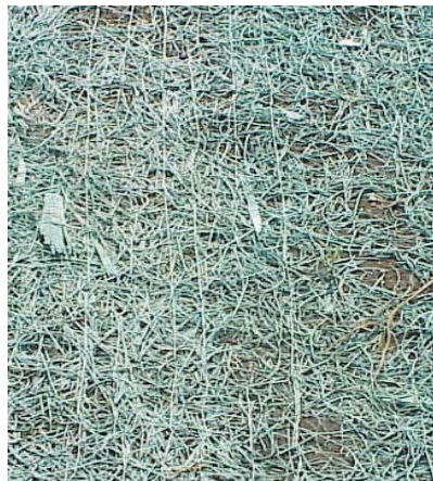
2. Non Curlex Fibers