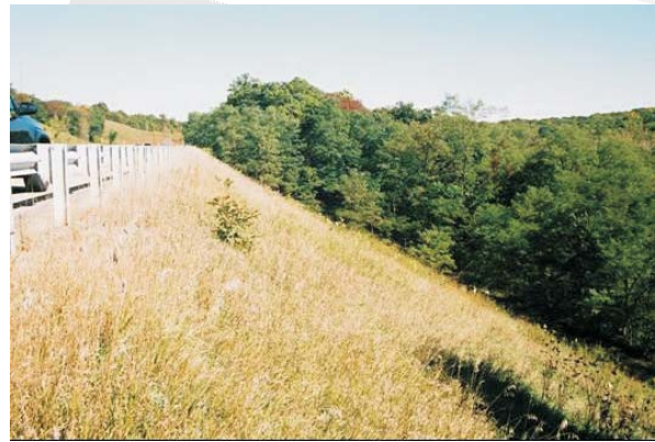
Figure 4. Figure 3 slope in 2004.