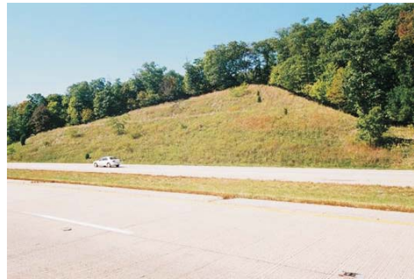
Figure 6. Figure 5 slope in 2004.