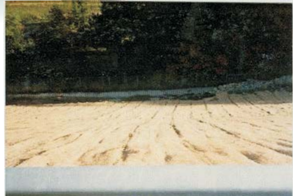
Figure 2. Steeper Curlex HV slopes 1987