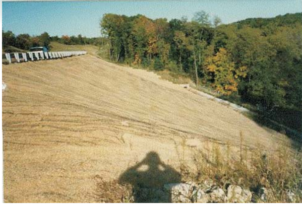
Figure 1. Curlex HV slopes in 1987.