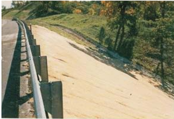
Figure 3. Curlex HV 1987.

All slopes consisted of loam soils and were seeded with IDOT standard roadside mix, which is comprised mainly of perennial rye, red fescue, and blue grass. 55,000 yd 2 of Curlex HV were installed on the steep road side slopes (1.5H:1V up to 200 ft long) and ditch bottoms at a rate of 600 yd 2 per man hour. 145,000 yd 2 of Curlex I were installed on the slopes along the remaining 3,000 linear feet of the project at a rate of approximately 30,000 yd 2 per day. The majority of the Curlex I slopes were 2.5H:1V and contained one terrace to break up the 300 ft long slopes.