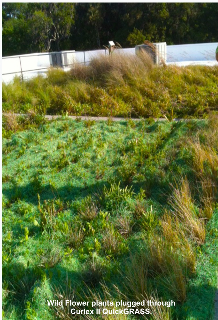
Wild Flower plants plugged through Curlex II QuickGRASS.