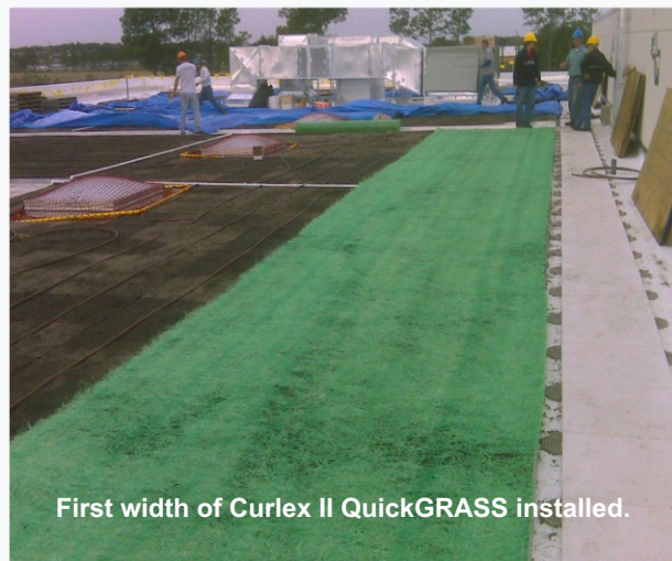
First width of Curlex II QuickGRASS installed.