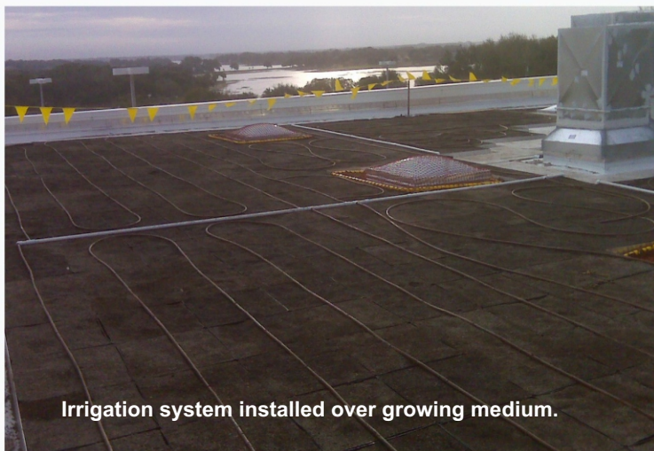
Irrigation system installed over growing medium.

Bringing Green Roofs to Life with Curlex