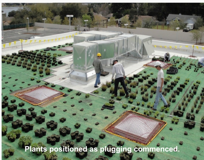
Plants positioned as plugging commenced.