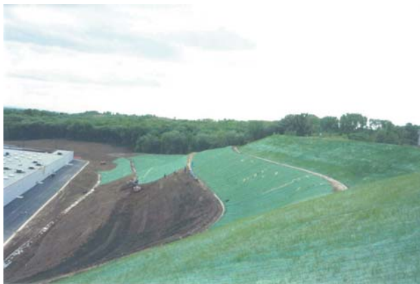
Figure 1. QuickGRASS ® provides an instant finished look, while protecting steep, long slopes.

QuickGRASS has been installed countless times in the past two decades (see Figures 1 & 2). In addition, numerous hydraulics tests have been conducted on QuickGRASS (see Figures 3 and 4). The unique QuickGRASS product maintains its green color after hydraulic events and provides the same superior erosion and sediment control features that are common to all Curlex brand products.