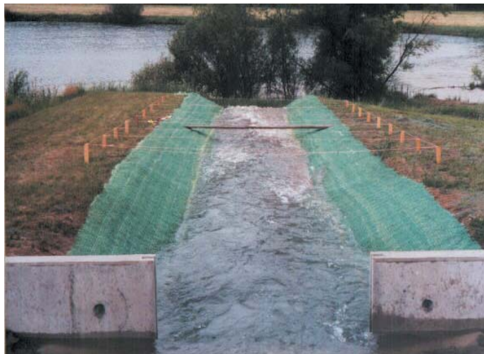
Figure 3. Hydraulic testing of QuickGRASS®.