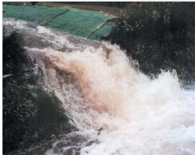
Figure 4. White water exiting test channel after flowing over green QuickGRASS®.

Be sure to specify Curlex QuickGRASS the next time you use a green ECB. The following suggested specifications can be followed to ensure you are buying a green product that is aesthetically pleasing, safe for the environment, and provides the high level of performance you expect from a Curlex ECB.