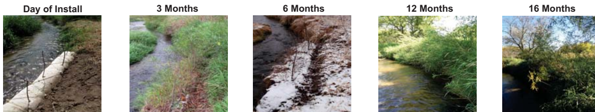
(willow live stakes and native sod used in this stream bank application)

Curlex Bloc continues to be used in conjunction with vegetation on stream bank restorations and other shoreline applications with low energy and wave action, but each day contractors are finding new applications for the product such as replacing wire backed silt fence with Curlex Blocs to protect sensitive wetlands. Using versatile Curlex Blocs as natural filters is becoming more and more common each day. They are the most effective product we have seen that does not contain flocculating materials. Let us know if you have a new application for Curlex Bloc.