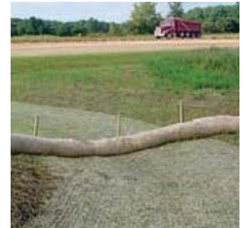
Curlex ® and Straw — ECB's led by Curlex products. First photo shows product after application. Second photo shows vegetation growing through product.