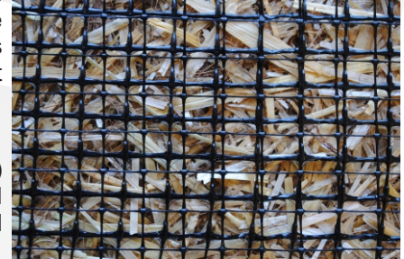
TriNet™ Coconut (now available)