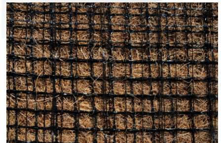
TriNet™ Curlex® (coming soon)