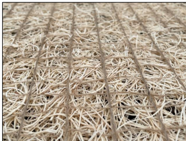
Figure 3: Close-up of Curlex II FibreNet.

THE MOST TRUSTED NAME IN EROSION CONTROL