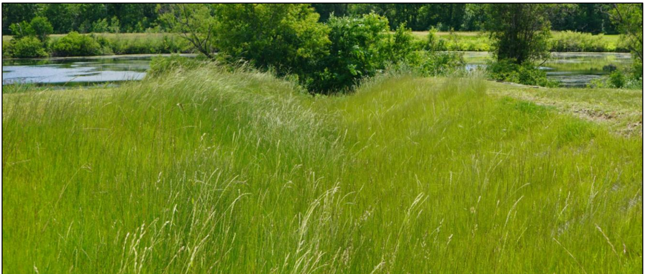
Figure 10: Results after 9 months.