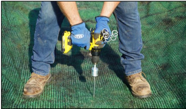
Figure 4: Gripple TLTA1-12in anchors being inserted into the TriNet Recyclex upon completion of initial grading.

Proper installation of specified BMPs is key to the success of any project. The following images (Figures 4 through 7) highlight some of the key installation processes specific to this project.