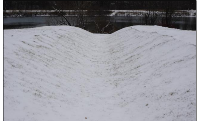
Figure 9: Results after 6 months. This photo was taken in March when snow was still on the ground in Wisconsin.