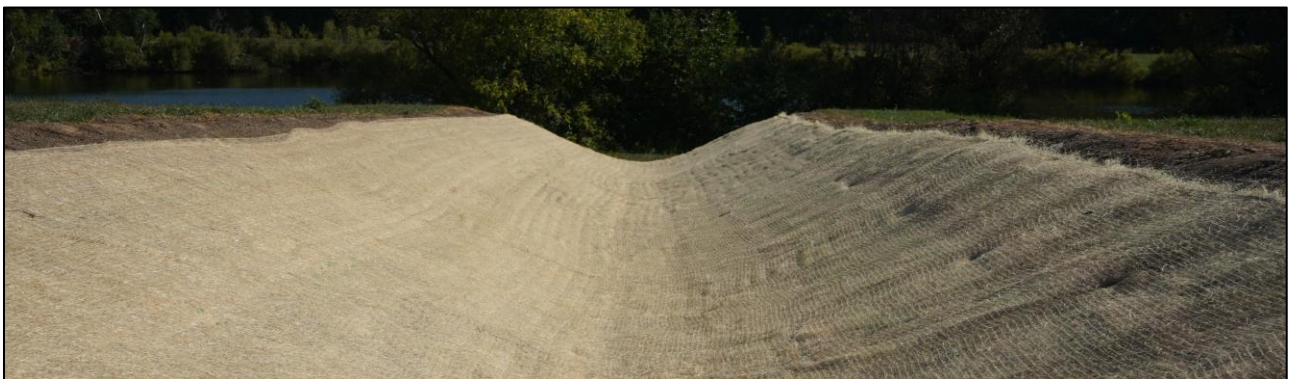
Figure 7: Completed installation of Curlex II FibreNet over soil filled TriNet Recyclex.

THE MOST TRUSTED NAME IN EROSION CONTROL