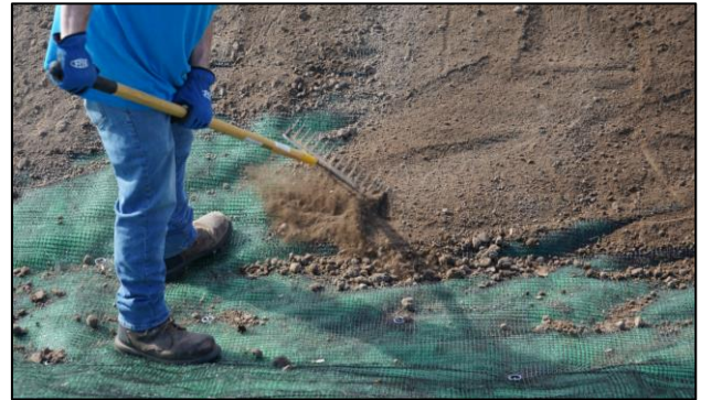
Figure 5: Soil filling and raking the approximately 1-inch soil veneer on top of the TriNet Recyclex.