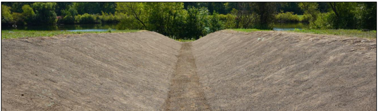
Figure 6: Channel after soil, seed, and amendments were added on top of the TriNet Recyclex.