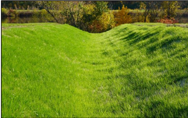
Figure 8: Results after 1 month.