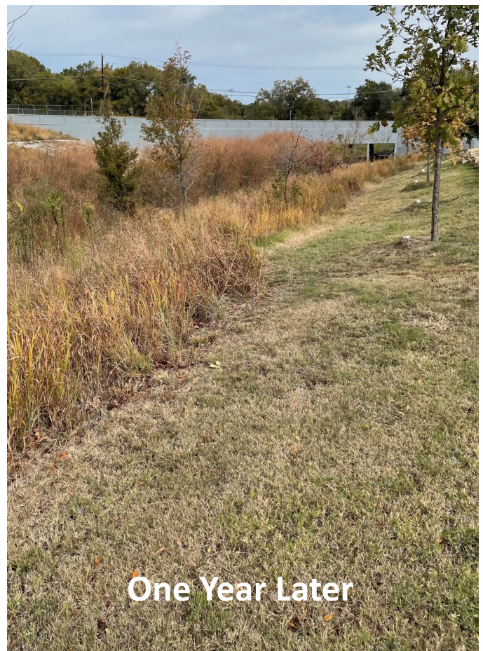
One Year Later

Not all long-term temporary erosion control blankets are created equally. Curlex III was chosen to protect the nearby waterway from erosion. Curlex III provides up to 36 months of protection. That level of performance ensures that vegetation has a chance to fully establish. All Curlex products are made in the USA using only sustainably harvested, naturally seed-free Great Lakes Aspen excelsior fibers. Questions? Give us a call. We can help.