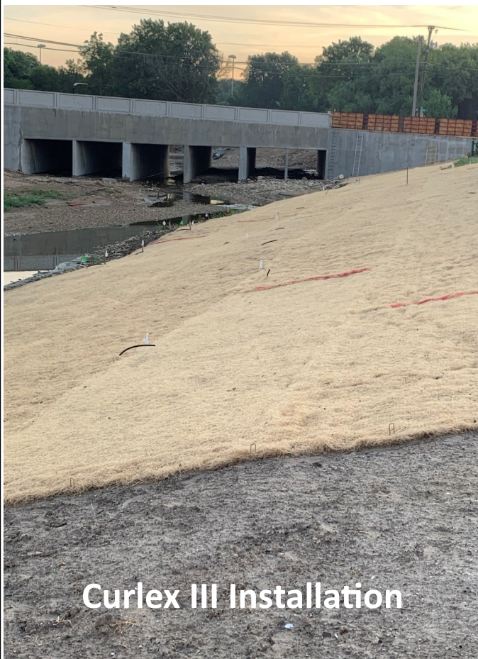
Curlex III Installation