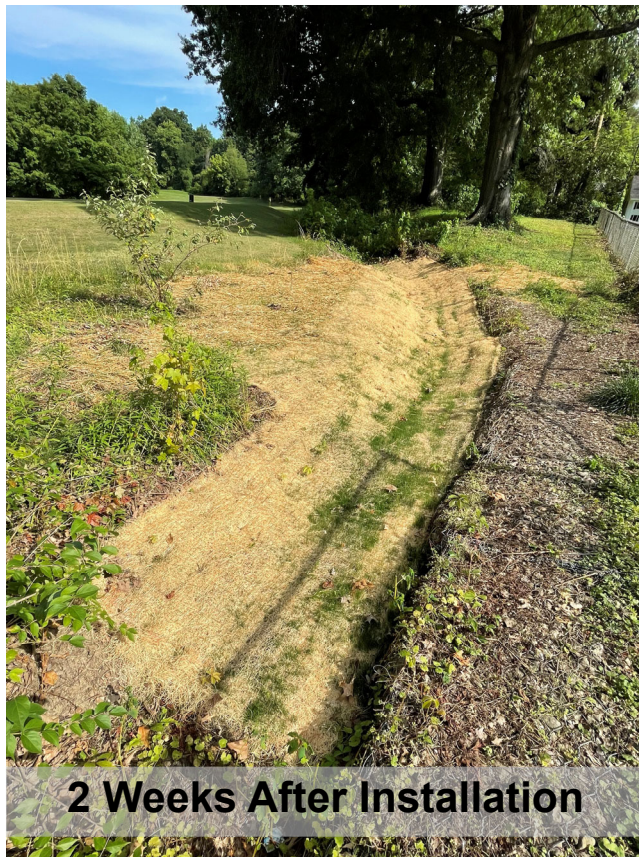
2 Weeks After Installation

The American Made Alternative to Imported Coconut Erosion Control Blankets