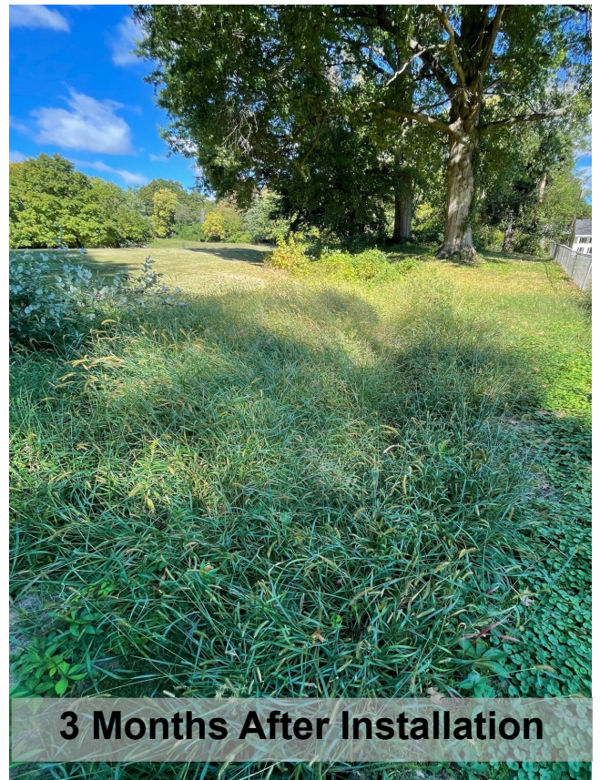
3 Months After Installation

Specifiers chose Curlex III to help create a vegetated waterway to drain runoff from an adjacent golf course. Curlex III is made in the U.S. from all-natural, sustainably sourced Great Lakes Aspen excelsior fibers. Curlex III provides protection for up to 36 months. All Curlex blankets are available with synthetic or natural jute netting. With sourcing concerns and the high cost of imported Coconut fibers, Curlex III is your solution.