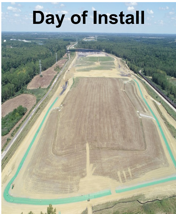
Day of Install

Building the Best Vegetated Channels to Protect Fly Ash Landfills