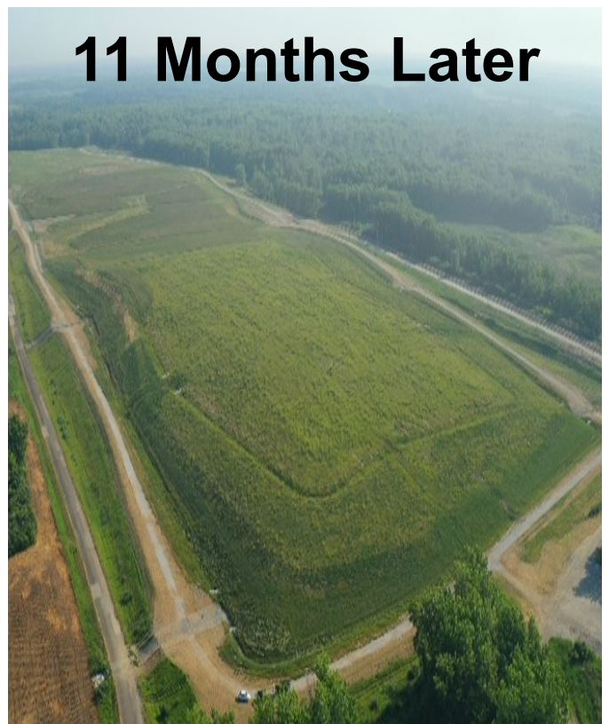
11 Months Later

American Excelsior's Recyclex TRM-V Turf Reinforcement Mats were chosen to protect these vegetated waterways at a fly ash landfill. With a specific gravity greater than one, Recyclex TRM-V will not float during hydraulic events unlike other TRMs. Recyclex TRM-V maintains intimate contact with the soil and seed-bed, while providing the ideal environment to hastened re-vegetation. Benefits of vegetated waterways are well documented and include cooler discharges, better water filtration, and infiltration and lower cost of installation. For additional information on our full line of Turf Reinforcement Mats visit us at