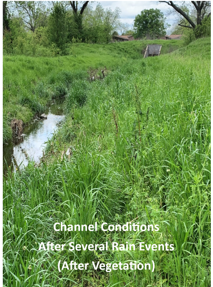
Channel Conditions After Several Rain Events (After Vegetation)