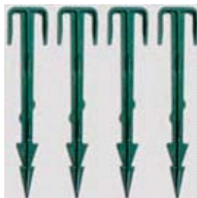
E-Staple® — Biodegradable staple to anchor rolled erosion control products to the soil.