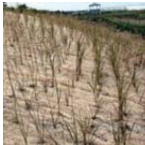
Curlex ® NetFree ™ - ECB without netting and made from biodegradable wood fibers.