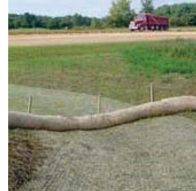
Curlex ® Sediment Log ® - Filter contaminated runoff, retain sediment, reduce velocity using biodegradable fibers.