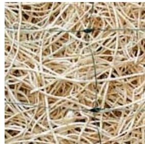
ECB's made with Ecocycle™ Technology and Curlex with NatureZone™ Nettings.