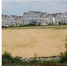
Curlex® and Straw - ECB's led by Curlex products. First photo shows product after application. Second photo shows vegetation growing through product.