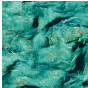
Bindex™ Family of Hydraulic Mulches with Curlex Fibers for hydraulic applications.