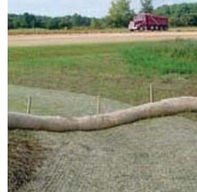
Curlex® Sediment Log® - Filter contaminated runoff, retain sediment, reduce velocity using biodegradable fibers.