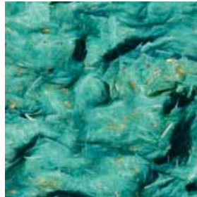
ECB's made with Ecocycle ™ Technology and Curlex with NatureZone ™ Nettings.