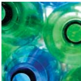
Approximately eighteen (18) plastic bottles are diverted from landfills for every pound of Recyclex ® fibers.