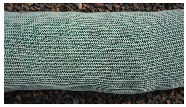
Curlex SFW with biodegradable containment material.

American Excelsior Company has innovated another product to answer an industry request. Straw wattles are very common, but they come with some inherent drawbacks, as experienced by those who have used them before. Straw wattles contain agricultural straw fibers that contain seeds, and the small, dusty fibers commonly fall out of the containment netting. Don't be fooled – straw wattles may be certified weed seed-free, but they still contain seeds. On the other hand, Curlex SFW (short fiber wood) is manufactured with seed-free excelsior fibers. Try Curlex SFW if you do not want to worry about the mess, species of seeds you will be introducing to your project, or wildlife destroying the product. Curlex SFW answers all the concerns of straw wattles while outperforming them, too. Curlex SFW is available with Poly or Biodegradable netting.