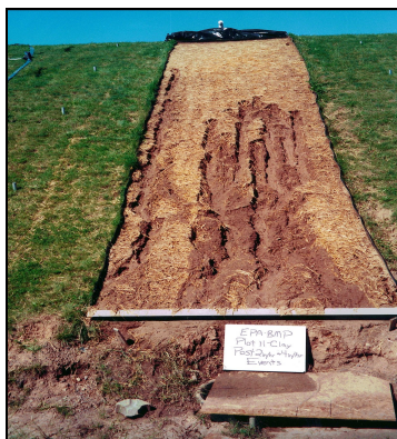
Figure 1. Clay plot after 2 and 4 in/hr tests with Blown Straw.

The data from plot testing were used to determine relevant parameters typically used in hydrologic analysis and design of erosion and sediment control plans. This evaluation included determination of the parameters used with the RUSLE soil loss prediction method as well as the runoff Curve Number (CN), and the Rational Method runoff coefficient (C) for estimating peak discharge.