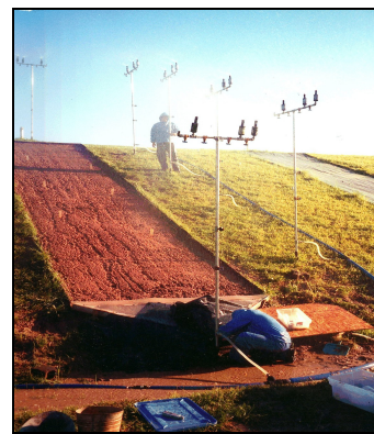
Figure 2. Clay plot after 2 and 4 in/hr tests on bare soil.