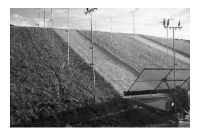
Figure 2. Erosion test plot during the 20.3 cm/hr (6 in/hr) portion of the test series.

cover BMP was to be tested, the BMP was installed according to manufacturer's recommendations at that time. The simulated rainfall series was started directly following compaction when bare soil controls were tested.