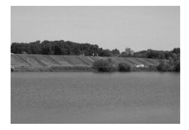
Figure 1. Onsite water source in foreground with rainfall erosion plots in background.

Fieldwork for this study was completed at American Excelsior Company's ErosionLab in Rice Lake, Wisc. The Rainfall Erosion Facility (REF) portion of the lab is equipped to test surface cover BMPs on hillslopes under simulated rainfall. REF testing follows procedures outlined in American Society for Testing and Materials (ASTM) ASTM D-6459, "Standard Test Method for Determination of Erosion Control Blanket (ECB) Performance in Protecting Hillslopes from Rainfall-Induced Erosion" (ASTM, 2001). REF contains 12 erosion plots that are 12.2 m (40 ft) long by 2.4 m (8 ft) wide and are separated from one another by a 4.9 m wide buffer of vegetated soil (see Figure 1). All 12 plots were constructed at an approximate 33 percent grade. There are four plots each of sandy loam, gravelly loam, and silty clay loam materials. All contents exiting the plots are directed into buried collection tanks by v-shaped metal flashing at the end of each plot.