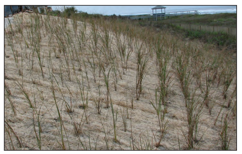
Innovation of netless products made plugging on slopes very easy.

The company further advanced ECBs in 2001 with the development of Curlex<sup>®</sup> NetFree<sup>™</sup>, which still remains the only biodegradable ECB that does not contain netting. The netless product consists of biodegradable curled and barbed excelsior fibers stitched together with biodegradable thread. The innovation helped expand the industry into more environmentally sensitive and urban areas.