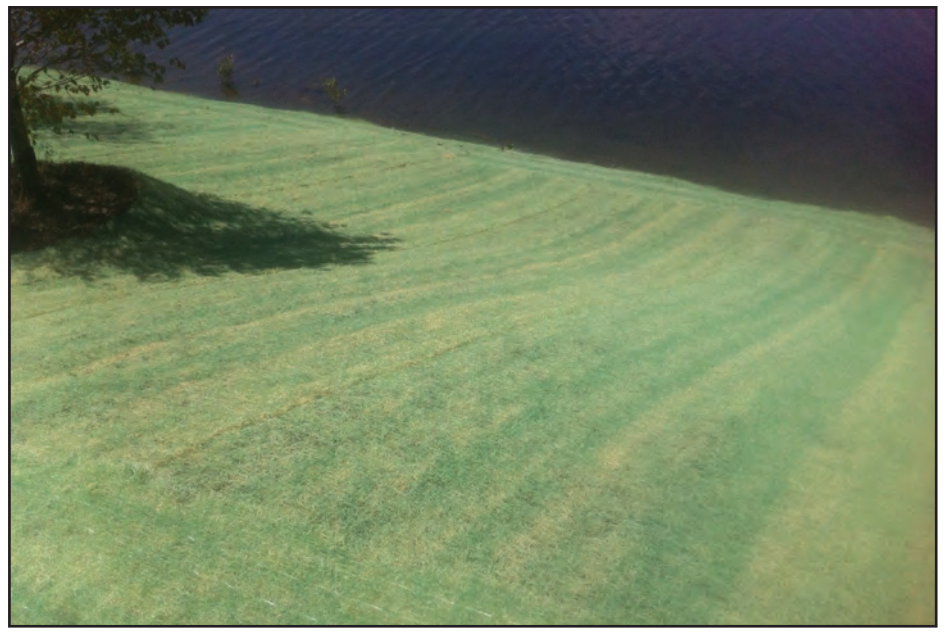
Dyed Green Excelsior ECBs offer a "finished look" to slope surface stabilization ECB applications.

It was not until 1984 that single net straw ECBs were first manufactured. The entire straw blanket process is cheaper than excelsior, but again not all products react or perform the same way. Flat, hollow straw fibers lay on top of the subgrade, thus they