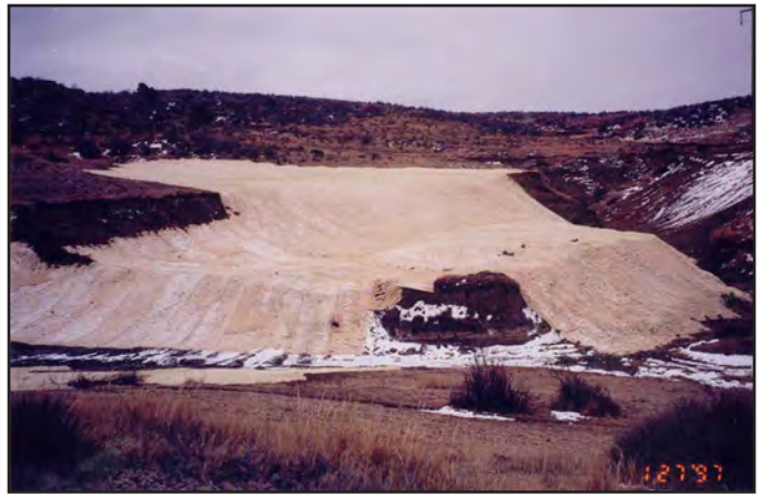
Excelsior ECBs on Utility Slope Surface Stabilization Project in 1997.

Today, IECA remains the largest industry organization focused on erosion and sediment control. Their annual Environmental Connection Conference brings to-