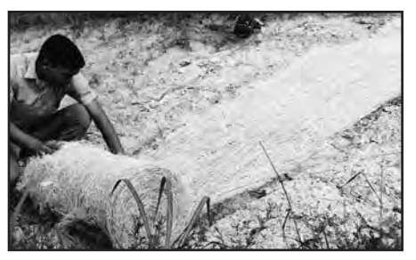
Curlex®, the first ever Erosion Control Blanket (ECB). Photo courtesy of American Excelsior Company.

In 1977, Congress amended the Clean Water Act to enhance the NPDES program. The amendment made the program more in-depth with a focus from conventional pollutants to toxic discharges. Congress passed the Water Quality Act (WQA)