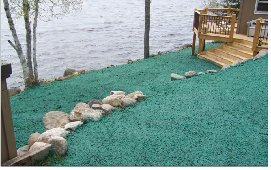
This BFM shoot was done as a dormant seeding project, late in the fall of 2012. Dormant seeding is done late in the year, when soil temperatures are too low for germination. The after picture was taken in the Spring of 2014. Location, Prairie Lake in Northern Minnesota.

A lot of advancements have occurred within ECTC since its inception. Today the membership includes manufacturers of erosion control products, fabricators of erosion control products, distributors of erosion control products, consulting engineers, universities and testing laboratories.