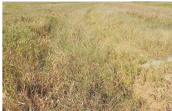
Drainage channel with fully established reinforced vegetation system.