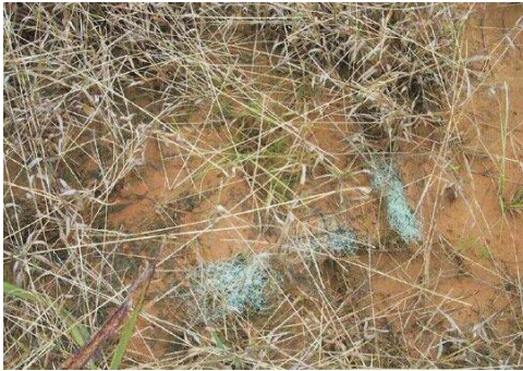
Naturally soil filled and vegetated drainage way.

To date, over 2,000 rolls of Recyclex have been installed in various applications at the project site. The product has been used to protect everything from hillslopes to concentrated flow channels. Straw bales were previously used to reduce flow velocity in drainage ways along terraces. The bales were unsuccessful in the loose sandy soil because the water scoured around and under the structures before they were able to reduce flow velocity. In the same drainage way, Recyclex was installed and anchored to the soil with wire staples. The Recyclex was allowed to naturally soil fill from the land area contributing to the drainage way. The fibers on the bottom of the blanket buried themselves into the subgrade to form a “synthetic root system” and the fibers on the topside of the product grabbed the soil particles that moved across it. Natural vegetation became established in the matrix after the seedbed presented itself.