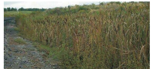
Roadside ditch bottom protected by vegetated Recyclex.

Recyclex has been used to replace a rip rap down shoot on the site. The subgrade below the rip rap washed out during a rain storm, so Recyclex was brought in because of its excellent subgrade contact. In this application, the Recyclex was seeded and watered to accelerate the establishment of vegetation. The product or the vegetation would not have survived a heavy rainfall on their own, but together the vegetation reinforced by Recyclex successfully replaced the rip rap.