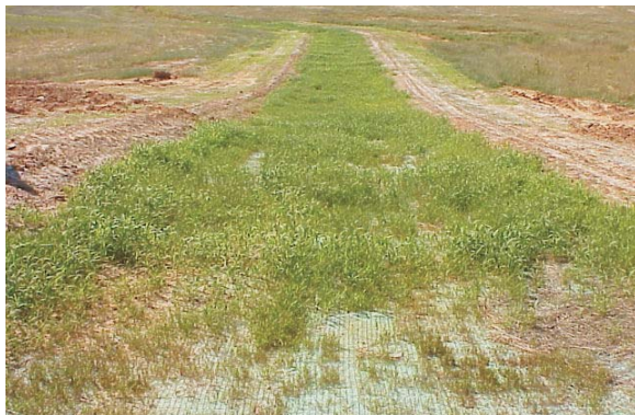
Drainage channel in the early stages of vegetation.